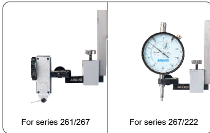
For series 261/267