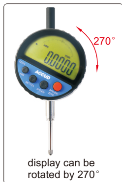
display can be rotated by 270°