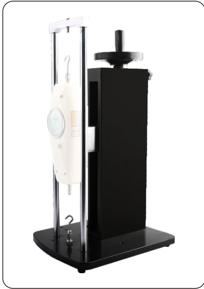
Stand(Code: FS1000 , Optional )