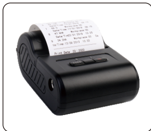
PR100 printer ( Optional )