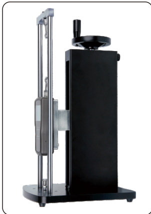
Stand(Code: FS1000 , Optional )